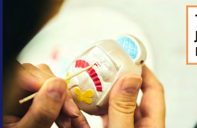
Thursday 7th August JTraditional Craft HAKATA DOLLS Painting Experience

Tuesday 12th August Japanese Traditional Food SUSHI Making Expericne