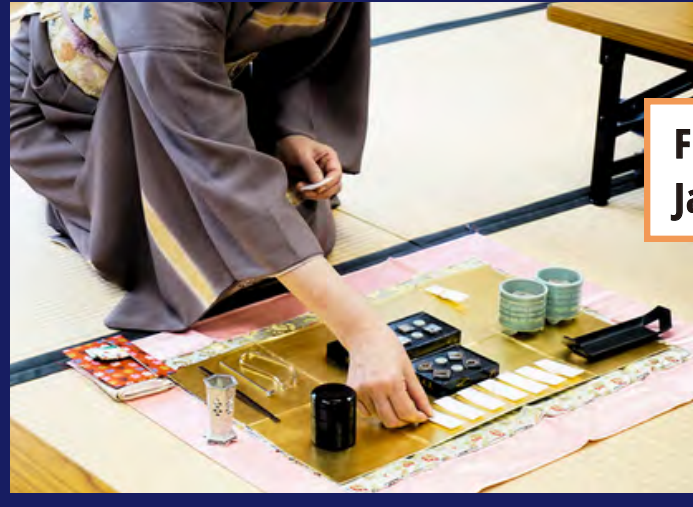
Friday 15th August Japanese Incense KODO Experience

Wednesday 20th August Japanese Budo KARATE Experience