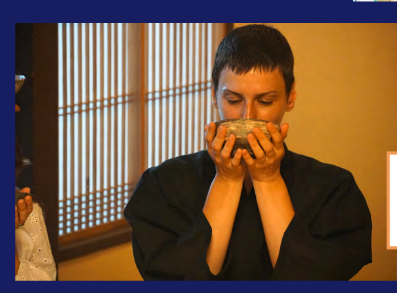
Tuesday 22nd July Japanese Culture TEA CEREMONY Experience