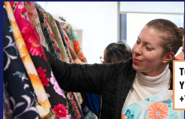
Tuesday 5th August YUKATA Experience +Tenjin Summer Festival