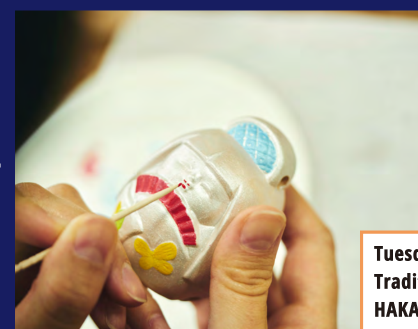
Tuesday 24th June Traditional Craft HAKATA DOLLS Painting Experience