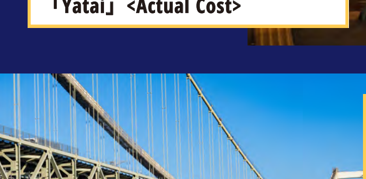
Saturday 21st June Crossing the Kanmon Straits Kyushu to The Main Island <6,000 JPY>

Monday 23rd June Fukuoka Speciality Mentaiko Making Experience <3,400 JPY>