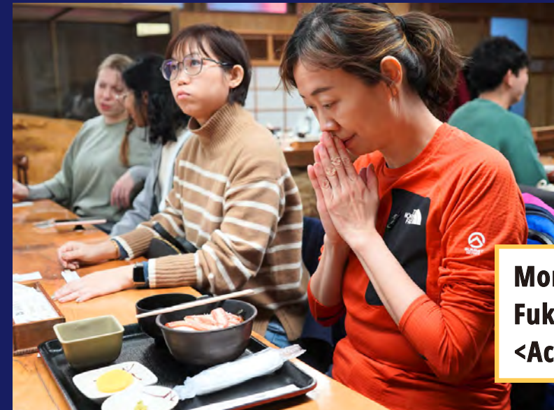
Monday 9th June Fukuoka Specialty Seafood Lunch <Actual Cost>