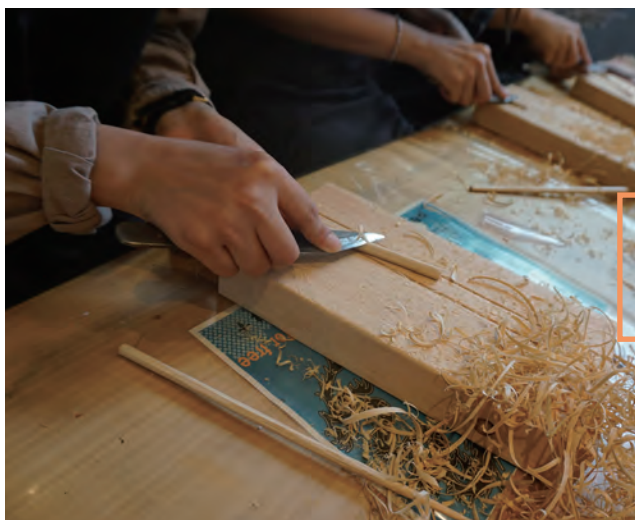
Thursday, July 8th CHOPSTICK CRAFTING EXPERIENCE!