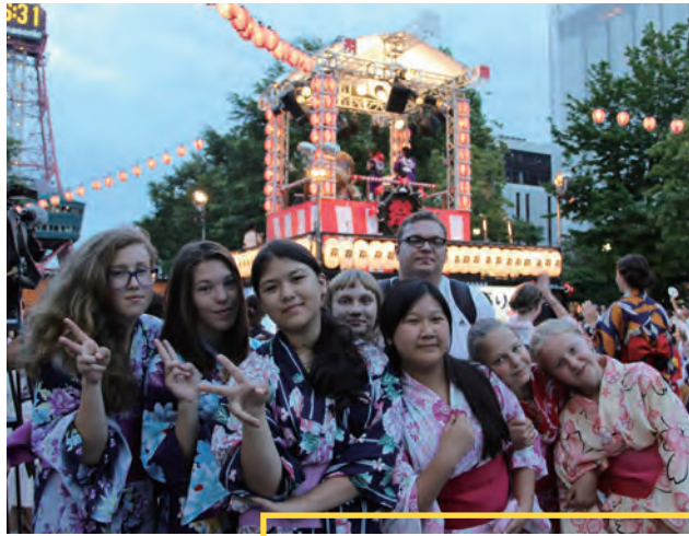
Tuesday, June 22nd SAPPORO SUMMER FESTIVAL <420JPY>