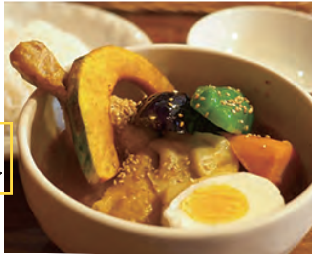
Thursday, June 24th SOUP CURRY LUNCH! <Actual cost>