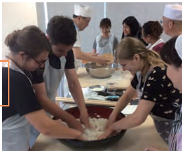
Tuesday, July 13th SOBA NOODLE MAKING!