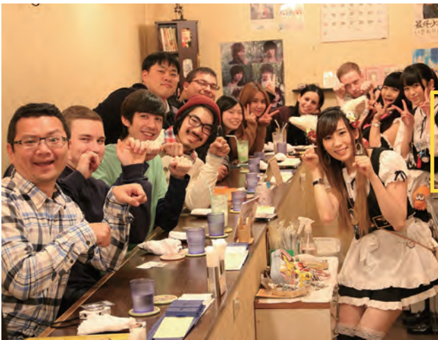
Wednesday, June 23rd MAID CAFÉ EXPERIENCE <1,500JPY>