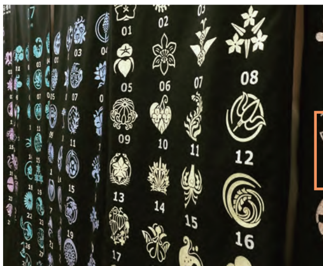
Thursday, July 15th KAMON PRINTING EXPERIENCE!