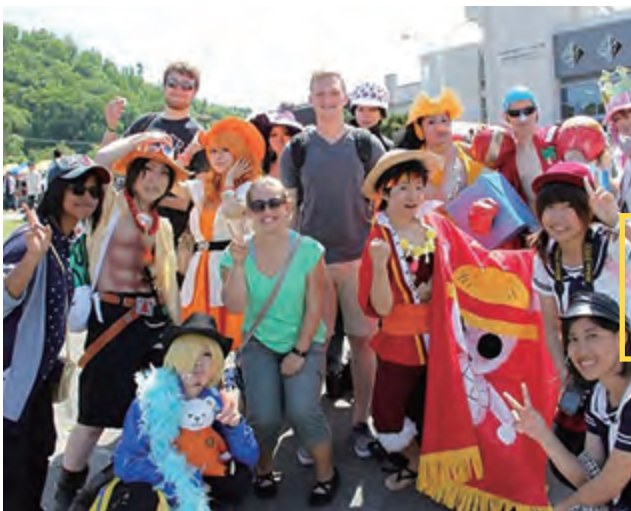
Saturday, June 26th LAKE TOYA ANIME FESTIVAL <5,200 JPY>