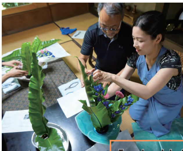
Tuesday, July 6th JAPANESE FLOWER ARRANGING!