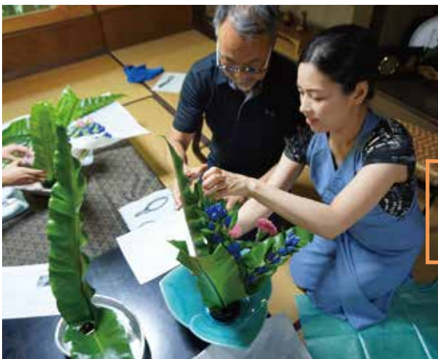
Monday, August 16th Kado Experience!