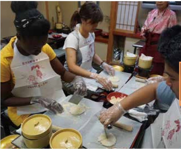
Tuesday, August 3rd Japanese Sweet Making!