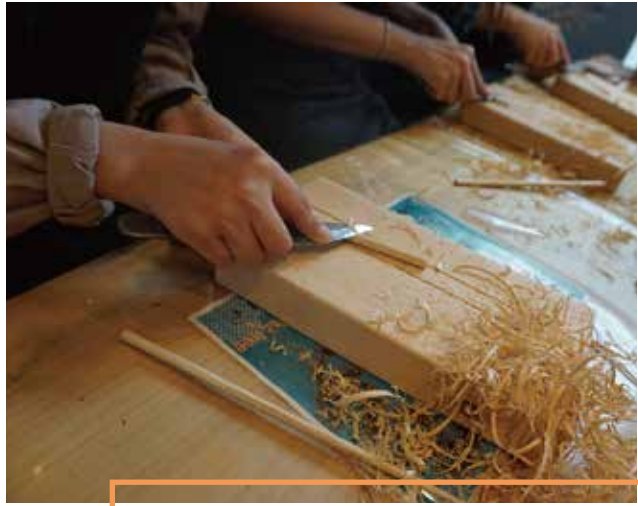
Tuesday, August 17th Chopstick Crafting Experience!