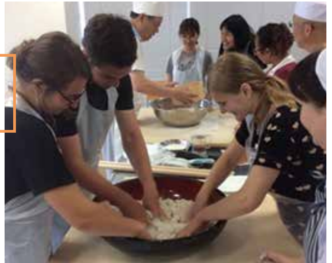
Wednesday, August 25th Soba Noodle Making!