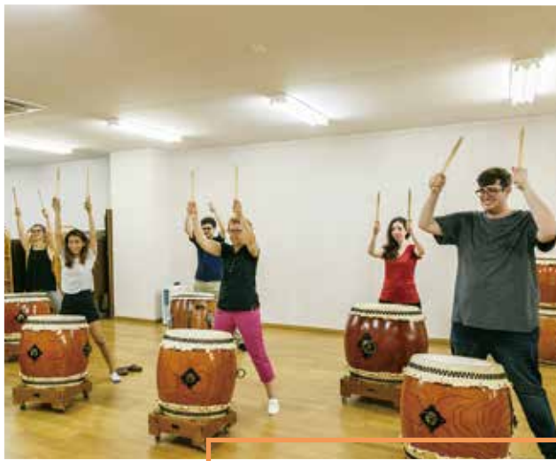
Monday, August 2nd Japanese Drumming Experience!