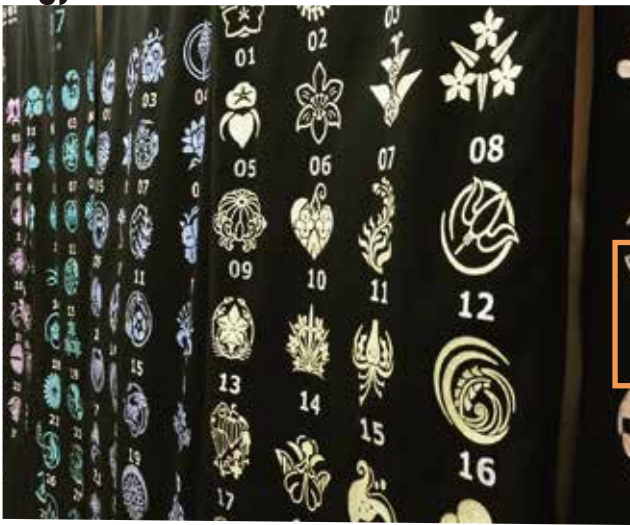
Monday, August 23rd Kamon Making Experience!