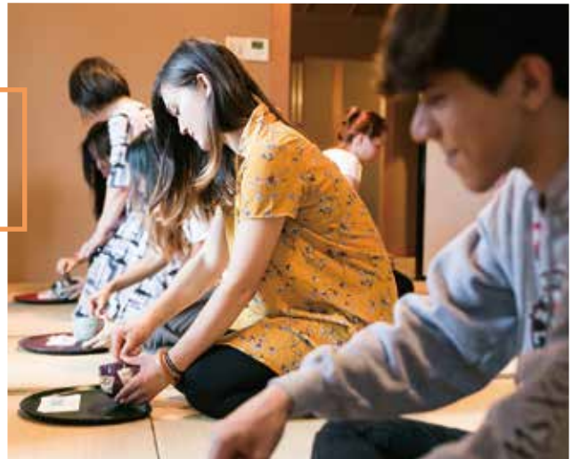
Tuesday, August 10th Tea Ceremony Experience!