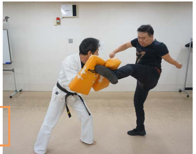
Thursday, June 29th Karate Experience!