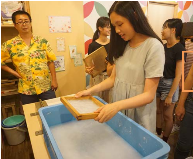
Tuesday, June 27th Japanese Paper Washi Making!