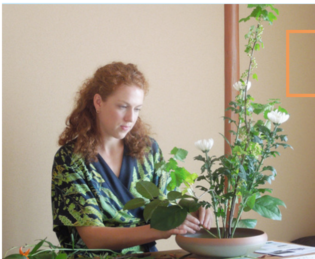
Tuesday, June 6th Japanese Flower Arranging!

IMPORTANT Please note that some cultural lessons or activities are subject to change or cancellation due to unforeseen circumstances, weather or attendance. Where this happens, activities or cultural lessons will be replaced with an alternative activity.