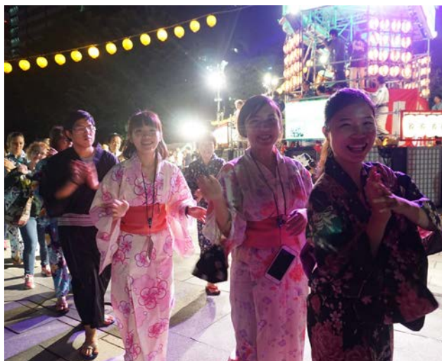
Thursday, June 15th Yukata Experience!