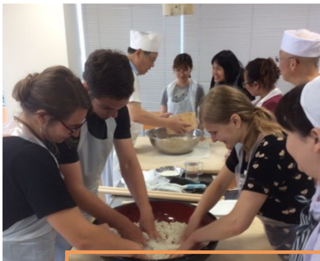
Tuesday, June 13th Soba Noodle Making Experience!