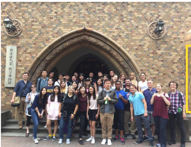
Wednesday, June 28th Hokkaido University Tour & Cafeteria Lunch <ACTUAL COST>