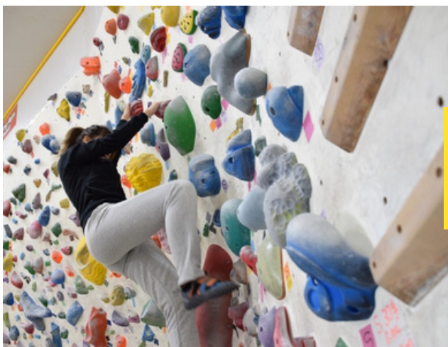
Wednesday, June 21st Rock Climbing <4,000 JPY>