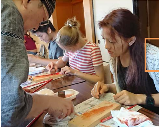
Tuesday, June 20th Chopstick Crafting Experience!