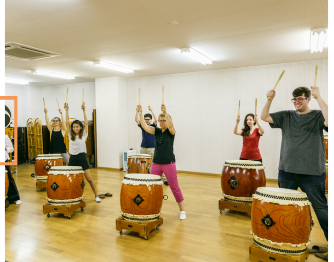
Thursday, June 22nd Japanese Drum Experience!