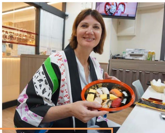
Thursday, June 8th Sushi Making Experience!