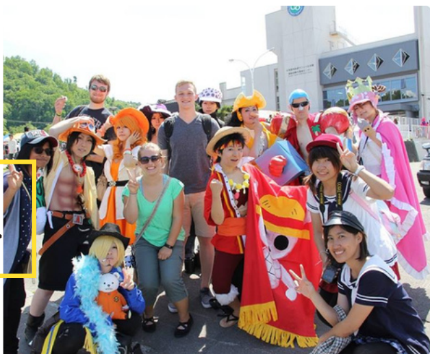
Saturday, June 24th TOYAKO Manga & Anime Festivals <5,660 JPY>