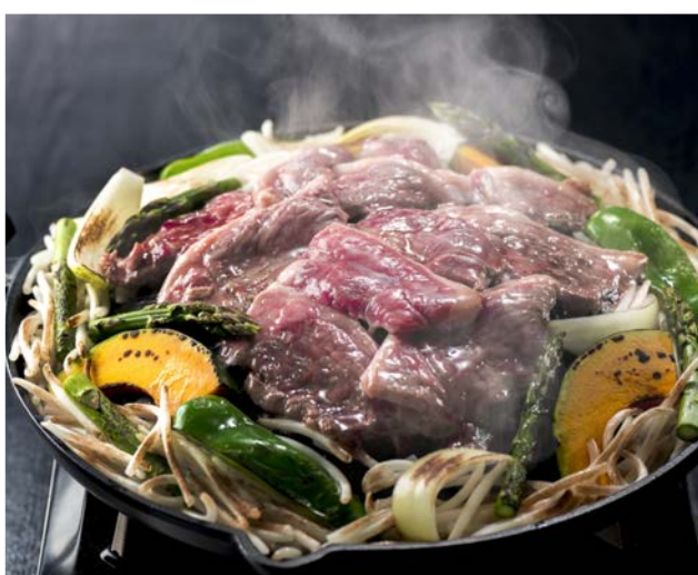
Friday, June 30th Sapporo Beer Museum & Hokkaido's Famous BBQ Lamb! <3,600 JPY>