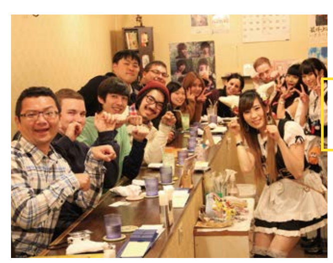
Wednesday, June 17th Maid Café Experience <1,500JPY>

Thursday, June 18th Soup Curry Lunch! <ACTUAL COST>