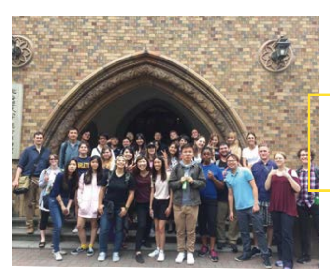
Thursday, June 25th Hokkaido University Tour! <ACTUAL COST>

Saturday, June 27th White Water Rafting <4,800JPY>