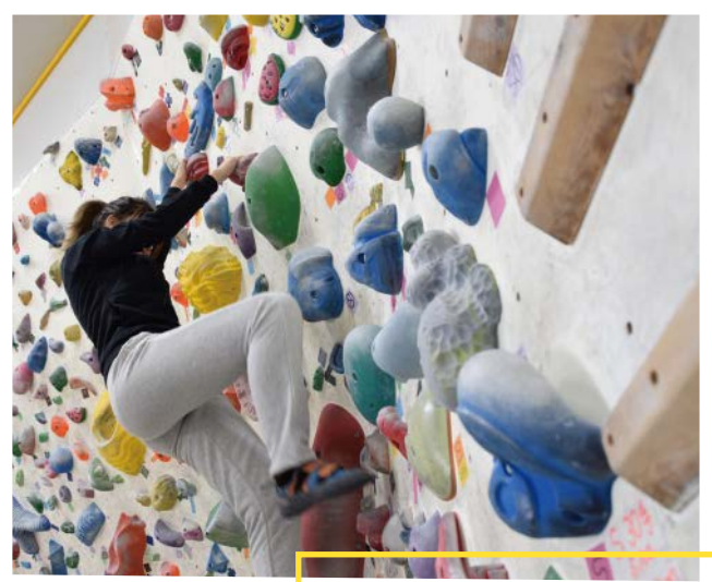
Monday, June 8th Let's Go Indoor Rockclimbing <2,300JPY>