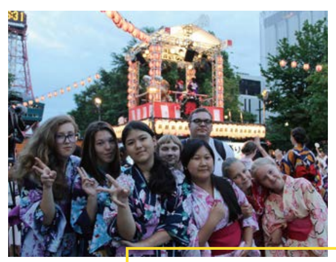
Tuesday, June 16th Sapporo Summer Festival <400JPY>