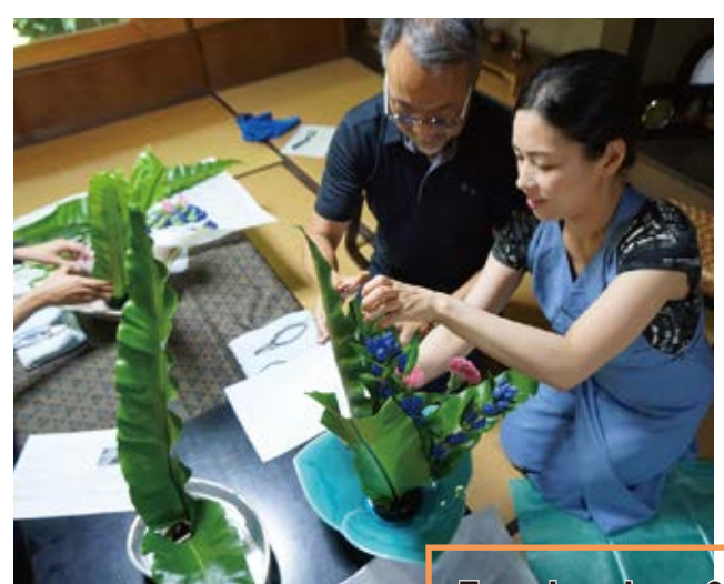
Tuesday, June 30th Japanese Flower Arranging!