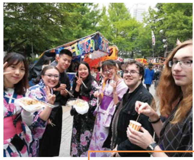
Tuesday, June 16th Yukata Experience!