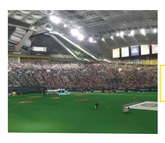
Friday, July 3rd Pro Baseball Game <2,500 JPY>