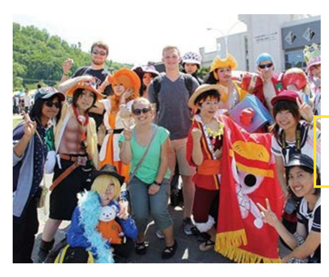
Saturday, June 20th Lake Toya Anime Festival <5,200 JPY>