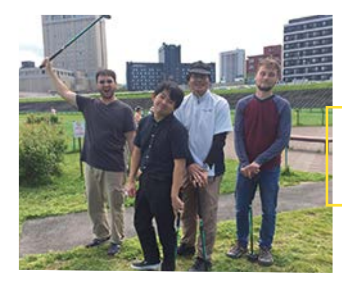
Wednesday, June 24th Park Golf Tournament! <900 JPY>