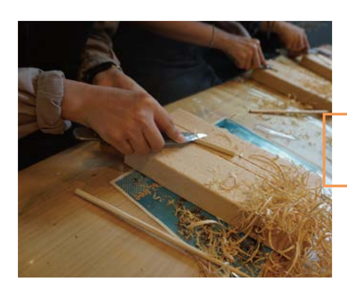
Thursday, July 2nd Chopstick Crafting Experience!