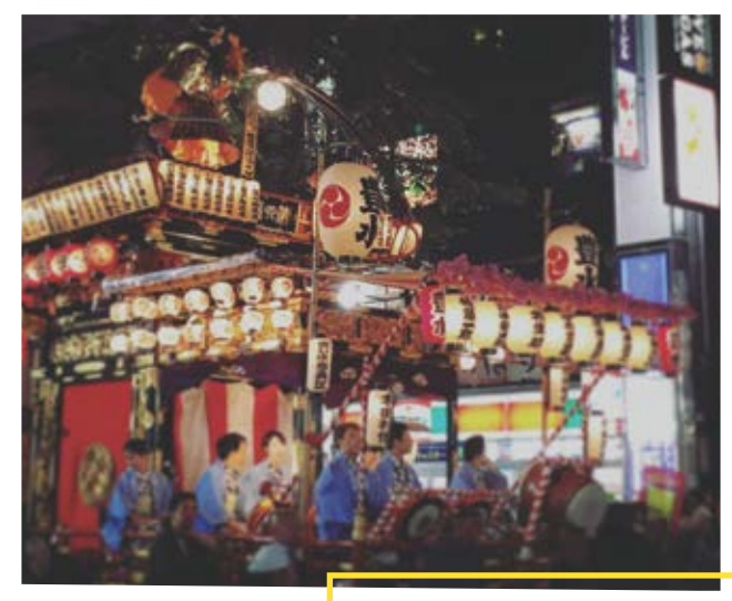
Thursday, July 30th Susukino Festival <ACTUAL COST>