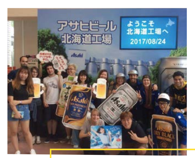
Thursday, August 20th Asahi Beer Factory <500 JPY>