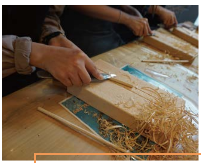
Tuesday, August 11th Chopstick Crafting Experience!

Monday, August 17th Kamon Making Experience!