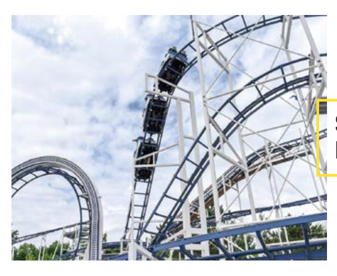
Saturday, August 8th Rusutsu Theme Park! <5,000 JPY>

Friday, August 14th Pro Baseball Game <2,500 JPY>