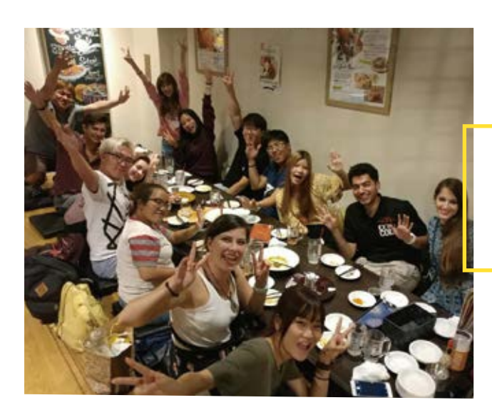
Friday, August 21st Summer Course Graduation Party! <2,980 JPY>

Saturday, August 22nd Hoheikyo Hot Spring Day <1,800 JPY>