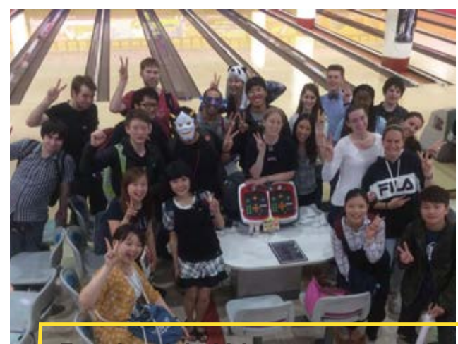
Tuesday, July 14th JaLS Bowling Tournament <1,550 JPY>

Monday, July 13th Welcome Lunch Party <FREE>