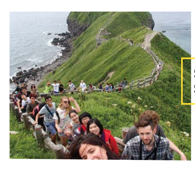
Saturday, August 15th Shakotan Blue Driving Tour <5,200 JPY>