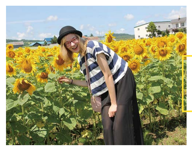
Saturday, August 1st Sunflower Fields & Asahiyama Zoo <5,200JPY>

Wednesday, August 5th Maid Café Experience <1,500 JPY>