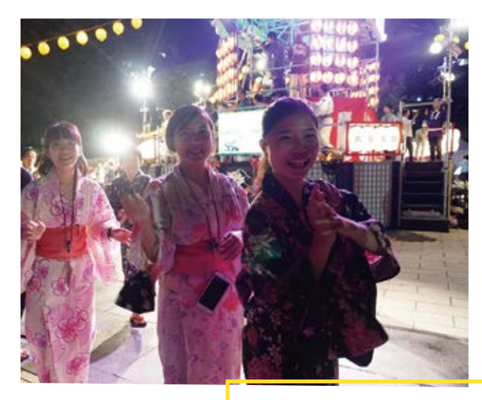
Friday, August 7th Bon Festival <FREE>