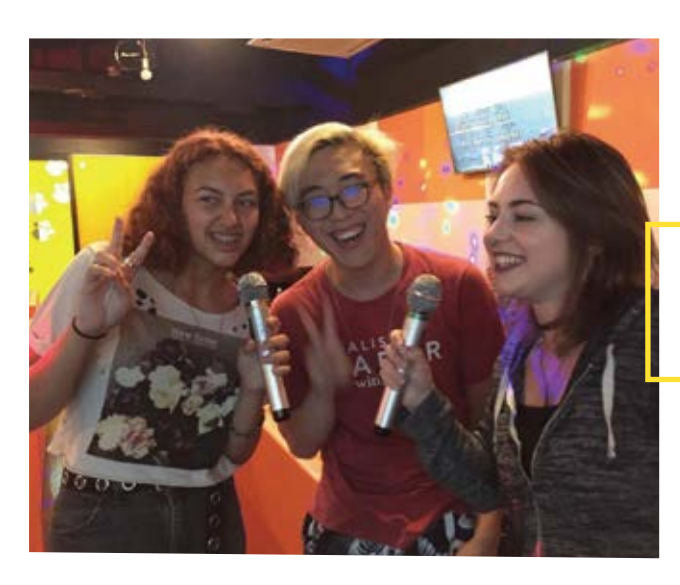
Thursday, August 6th JaLS Karaoke Party! <1,080 JPY>