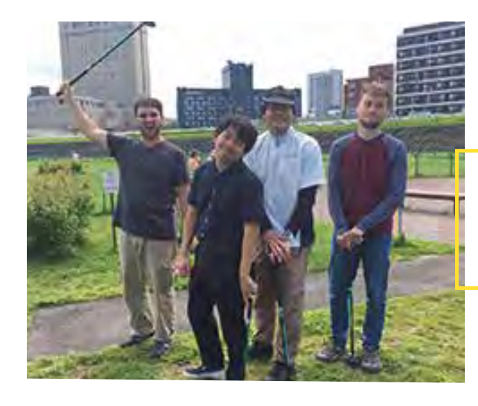
Wednesday, June 30th PARK GOLF TOURNAMENT! <900 JPY>