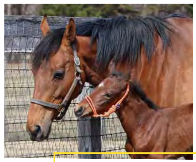
Saturday, July 10th NORTHEM HORSE PARK HORSEBACK RIDING EXPERIENCE <3,840 JPY>

Monday, July 12th MOUNT MOIWA ROPEWAY <2,100 JPY>