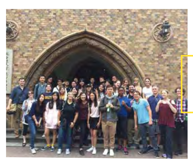
Thursday, July 1st HOKKAIDO UNIVERSITY TOUR! <ACTUAL COST>

Saturday, July 3rd WHITE WATER RAFTING < 4,800JPY>