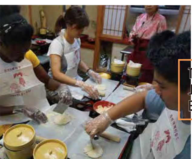
Thursday, June 25th JAPANESE SWEET MAKING EXPERIENCE!!