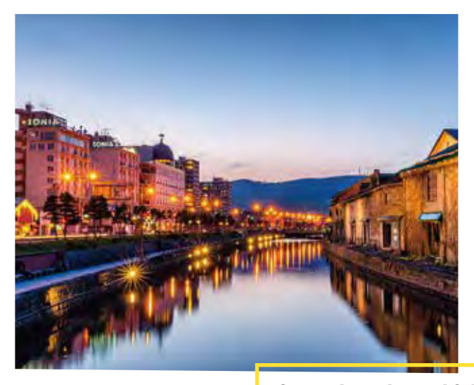
Saturday, June 12th OTARU TOUR <1,280JPY>