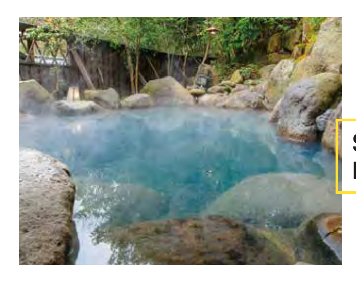
Saturday, June 19th HOHEIKYO HOT SPRING DAY<1,800 JPY>