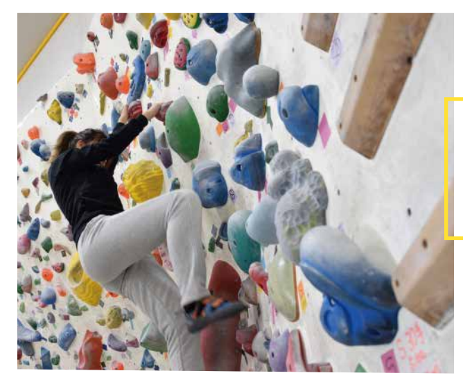
Monday, June 14th LET'S GO INDOOR ROCKCLIMBING <2,300 JPY>