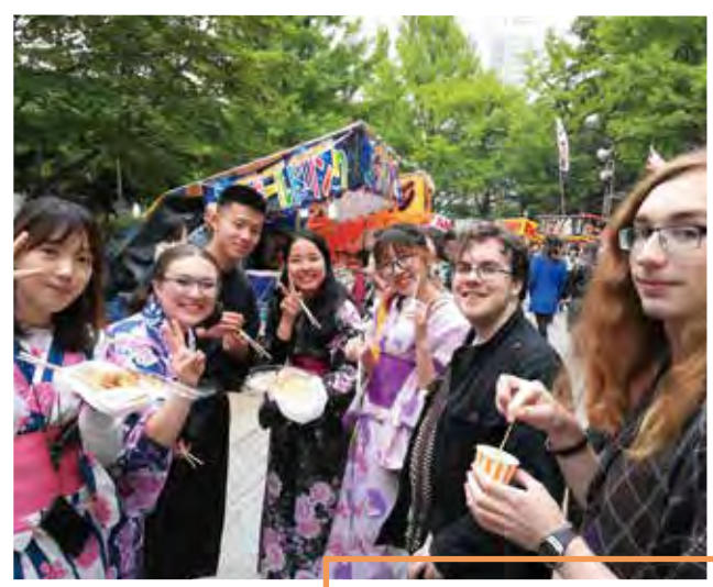
Tuesday, June 22nd YUKATA EXPERIENCE!