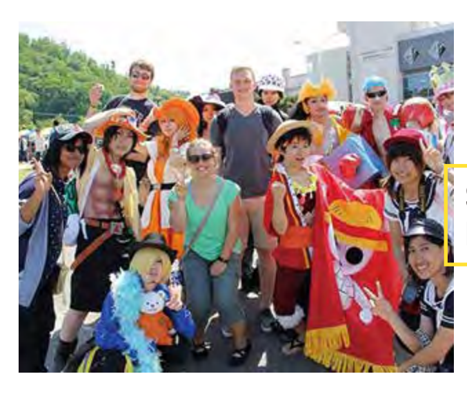
Saturday, June 26th LAKE TOYA ANIME FESTIVAL <5,200 JPY>