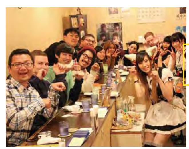
Wednesday, June 23rd MAID CAFÉ EXPERIENCE <1,500JPY>