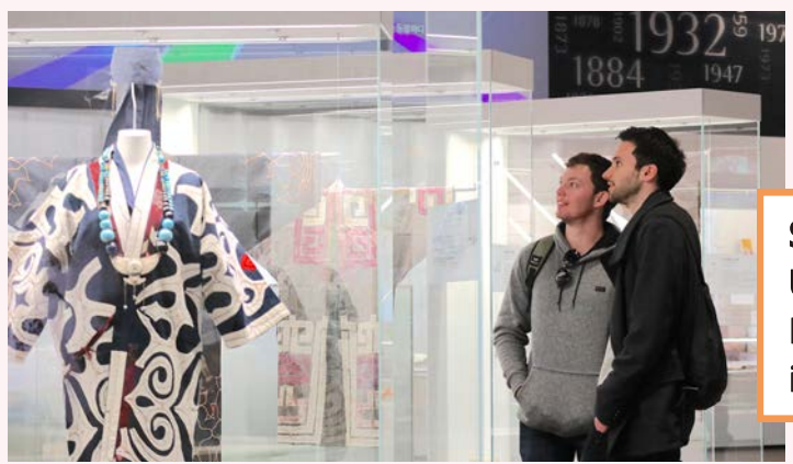
Saturday 6th April UPOPOY NATIONAL AINU MUSEUM <5,400 JPY> Let' s experience the traditional Ainu (Hokkaido indigenous people) culture!