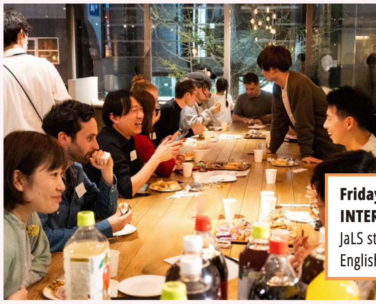
Friday 26th April INTERNATIONAL EXCHANGE PARTY! <1,500 JPY> JaLS students and Japanese people who are learning English, let's have fun talking in each language!