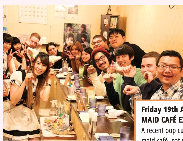
Friday 19th April MAID CAFÉ EXPERIENCE <Actual Cost> A recent pop culture experience in Japan – let' s visit a maid café, eat some food and take pictures.