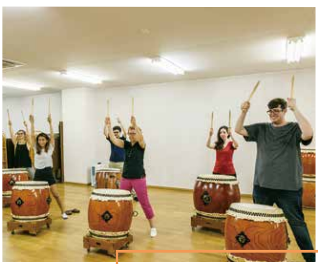
Monday, August 2nd Japanese Drumming Experience!