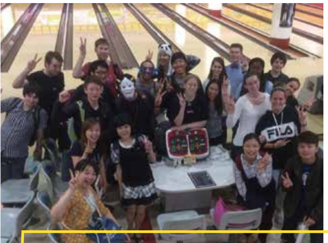
Tuesday, July 20th JaLS Bowling Tournament <1,740 JPY>

Monday, July 19th & August 9th Welcome Lunch Party <FREE>