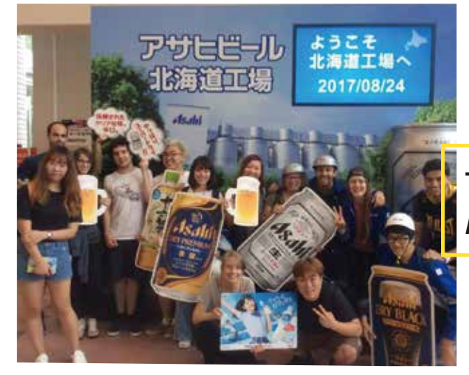
Thursday, August 26th Asahi Beer Factory <500 JPY>

Friday, August 27th Summer Course Graduation Party! <2,980 JPY>