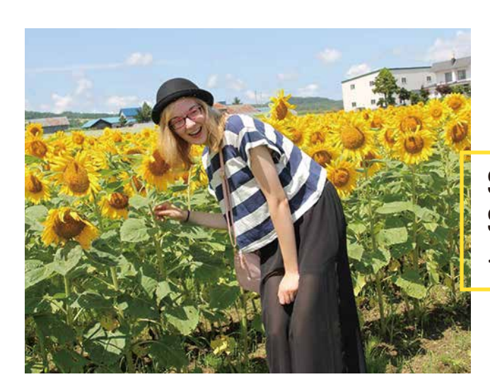
Saturday, August 7th Sunflower Fields & Asahiyama Zoo <5,200JPY>

Wednesday, August 11th Maid Café Experience <1,500 JPY>