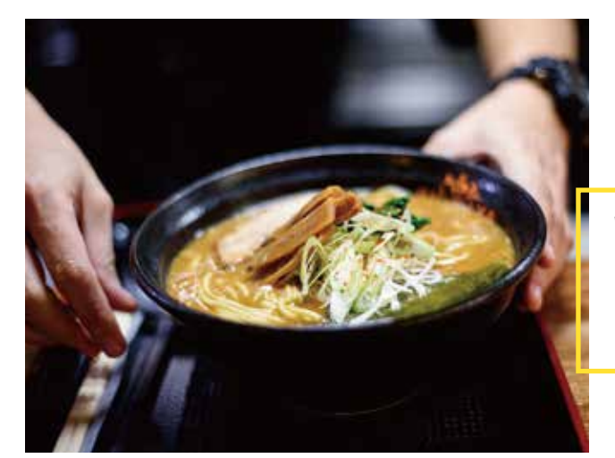
Wednesday, August 4th Ramen Republic and JR Tower! <ACTUAL COST+740 JPY>

Thursday, August 5th Susukino Festival <ACTUAL COST>