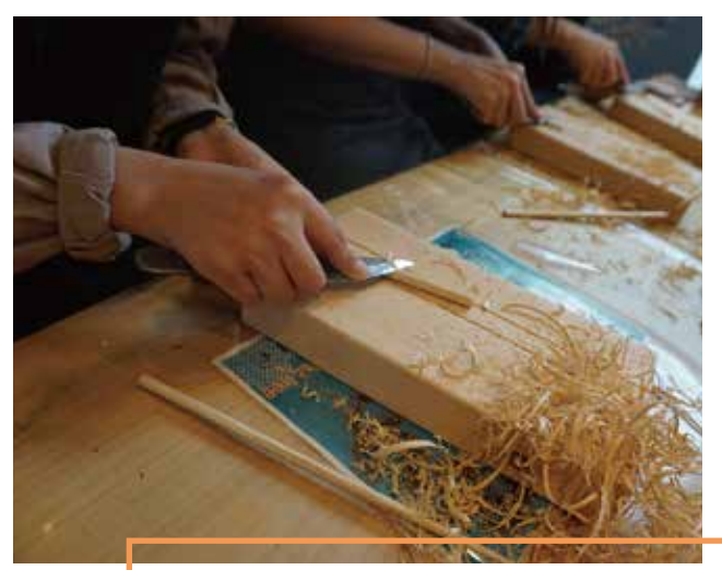
Tuesday, August 17th Chopstick Crafting Experience!