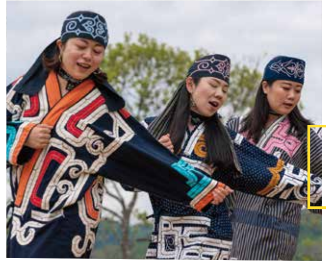
Saturday, July 31st Ainu Culture&Noboribetsu < 5,200 JPY >