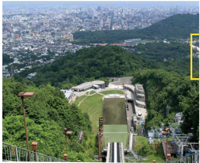
Wednesday, July 28th Okurayama View Point <1,560 JPY>

Thursday, July 29th and Thursday, August 19th Japanese Conversation Class <FREE>