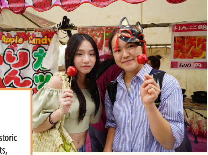
Hokkaido JaLS SUMMER COURSE

Let's experience the traditional parade festival in the historic town of Otaru and take a stroll through its historic streets, feeling the foreign influences!