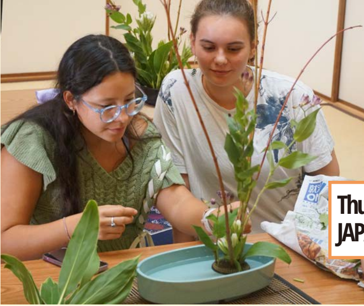
Thursday, October 24th JAPANESE FLOWER ARRANGING EXPERIENCE