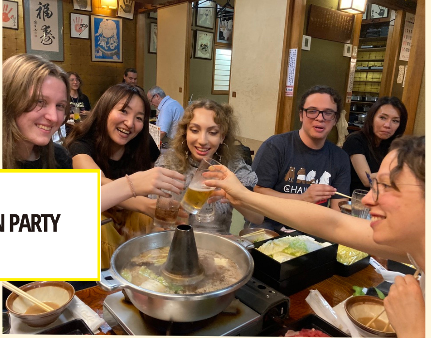
Friday, November 1st AUTUMN COURSE GRADUATION PARTY <4,000 JPY>