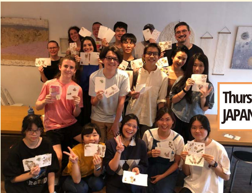
Thursday, October 31st JAPANESE PAPER MAKING EXPERIENCE