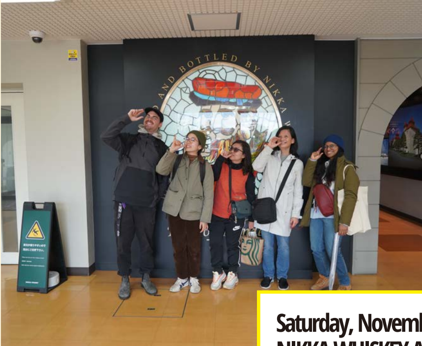
Saturday, November 2nd NIKKA WHISKEY AND OTARU TOUR <2,480 JPY>