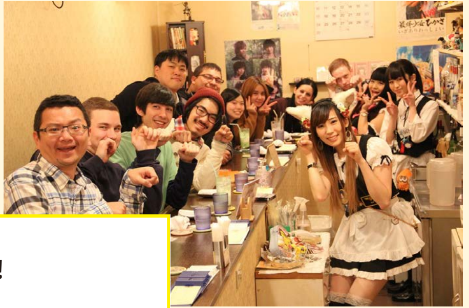
Friday, October 18th MAID CAFE EXPERIENCE! <Actual Cost>