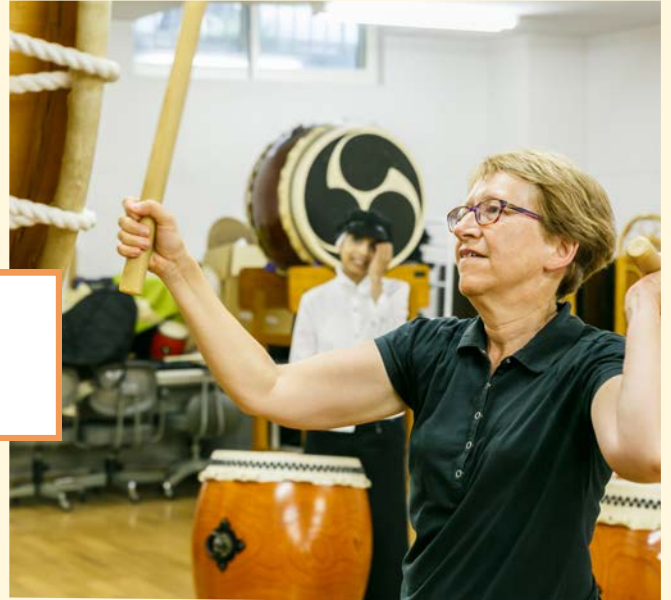
Wednesday, October 30th JAPANESE DRUM EXPERIENCE