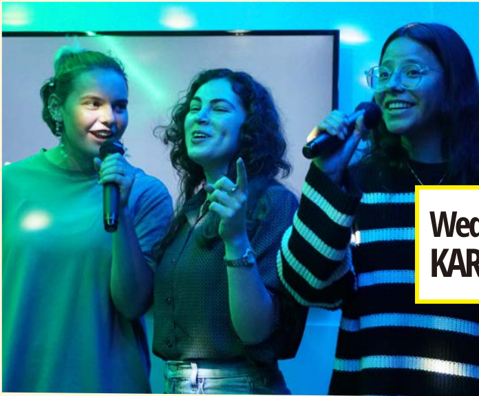
Wednesday, October 23rd KARAOKE PARTY <1,100 JPY>