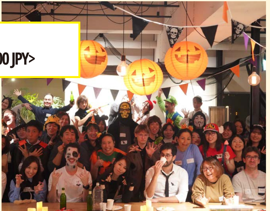
Friday, October 25th HALLOWEEN PARTY! <2,000 JPY>