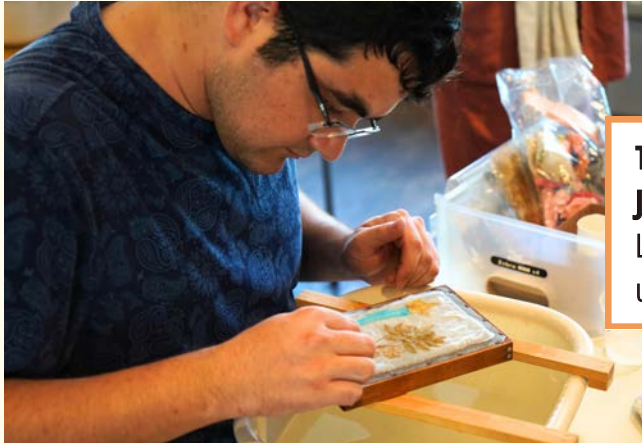
Tuesday 18th June JAPANESE PAPER MAKING! Let's make Washi (Japanese paper) from wood fibers using a traditional Japanese method!