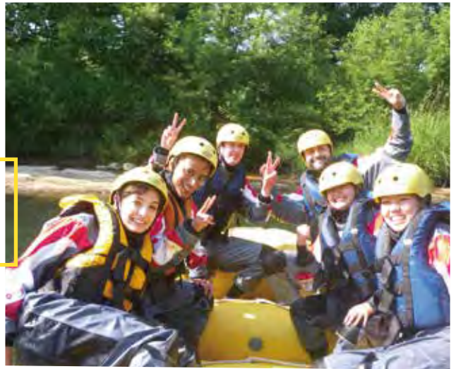
Saturday, July 3rd WHITE WATER RAFTING <4,800JPY>