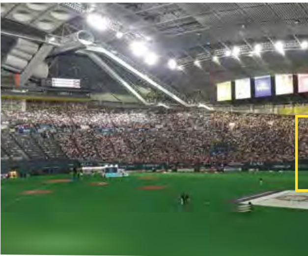
Friday, July 9th PRO BASEBALL GAME <2,500 JPY>