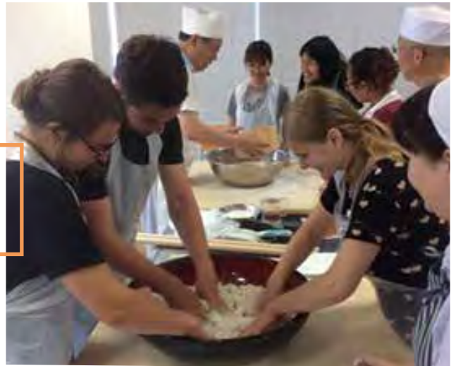
Tuesday, July 13th SOBA NOODLE MAKING!