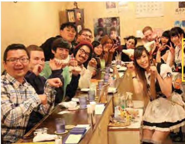
Wednesday, June 23rd MAID CAFÉ EXPERIENCE <1,500JPY>