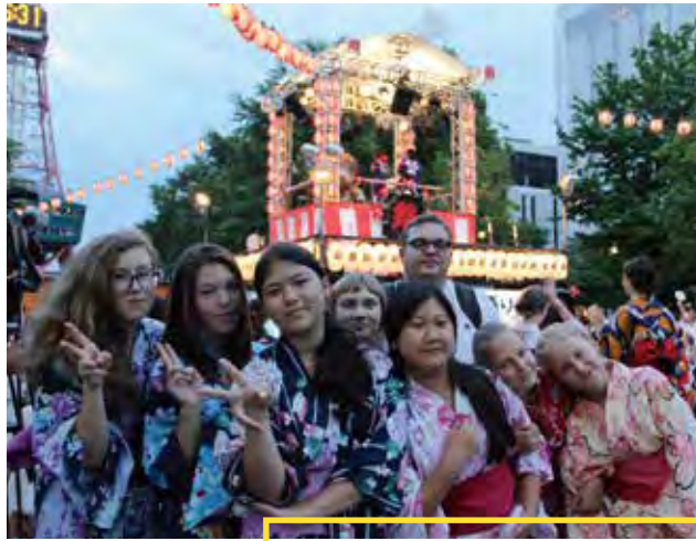
Tuesday, June 22nd SAPPORO SUMMER FESTIVAL <420JPY>