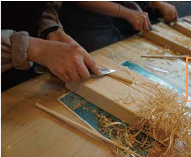
Thursday, July 8th CHOPSTICK CRAFTING EXPERIENCE!