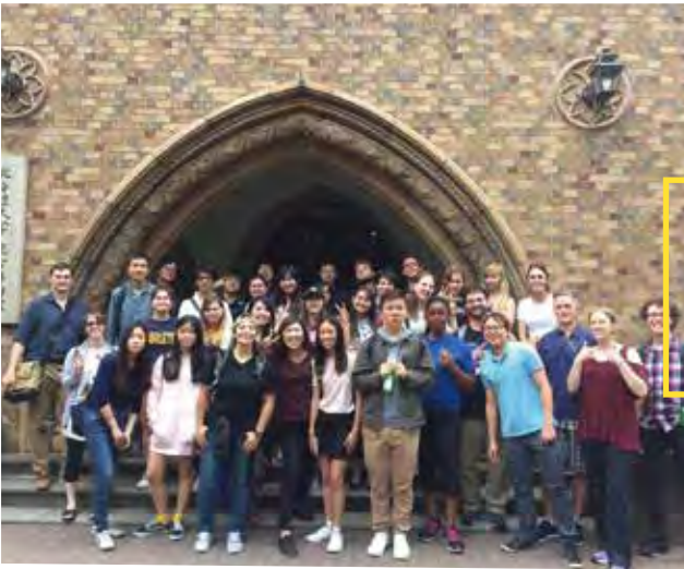
Thursday, July 1st HOKKAIDO UNIVERSITY TOUR! <ACTUAL COST>