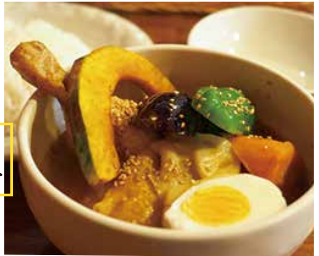
Thursday, June 24th SOUP CURRY LUNCH! <Actual cost>