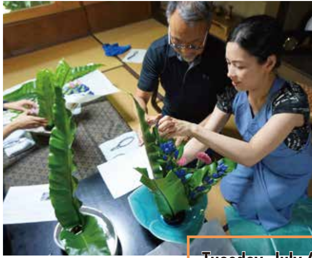
Tuesday, July 6th JAPANESE FLOWER ARRANGING!