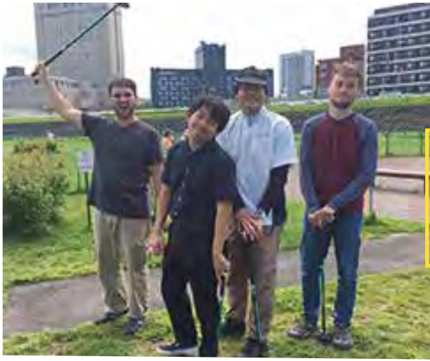
Wednesday, June 30th PARK GOLF TOURNAMENT! <900 JPY>