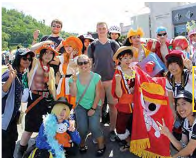
Saturday, June 26th LAKE TOYA ANIME FESTIVAL <5,200 JPY>