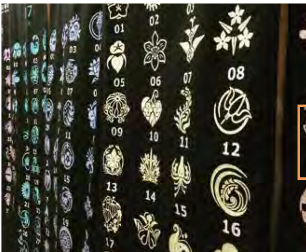
Thursday, July 15th KAMON PRINTING EXPERIENCE!