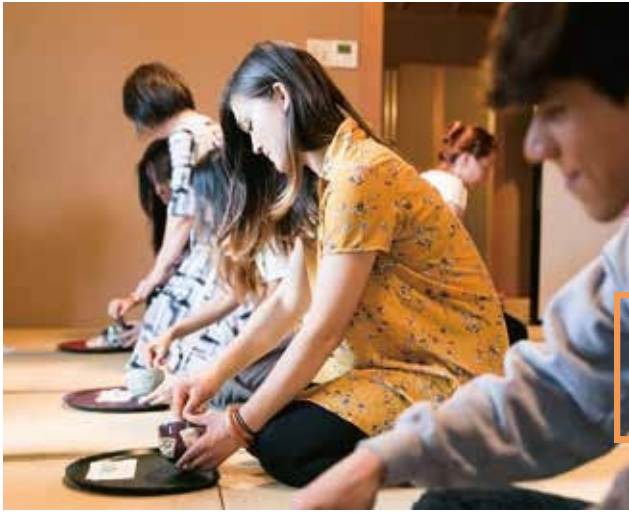
Tuesday, June 18th Tea Ceremony Experience