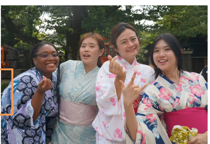
Kyoto Jals SUMMER COURSE 2025

Thursday, June 12th Kimono Experience & Phototaking