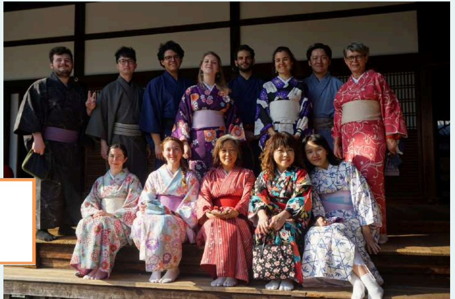
Thursday, Jan 30th Kimono Experience