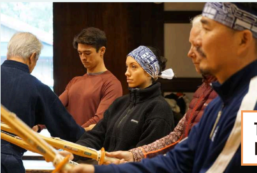
Tuesday, Feb 4th Kendo Experience