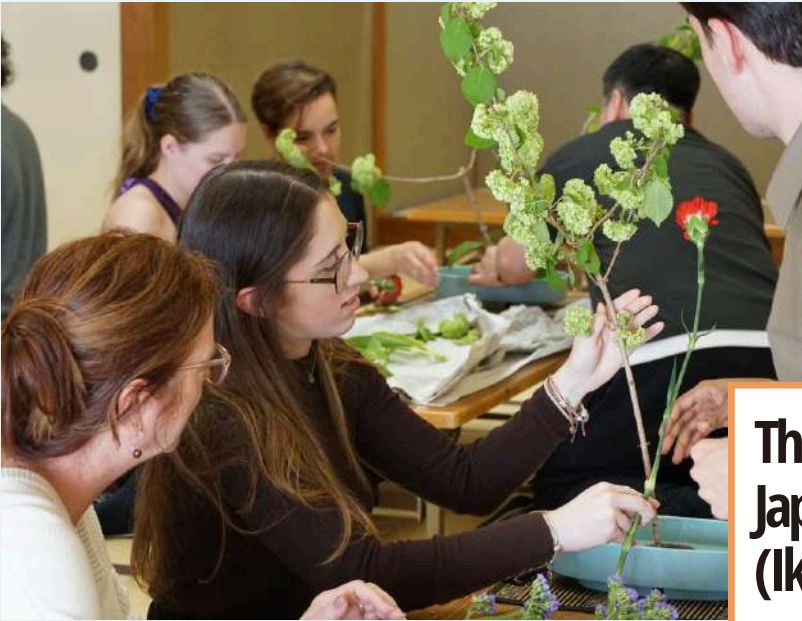
Thursday, Feb 6th Japanese Flower Arranging (Ikebana) Experience