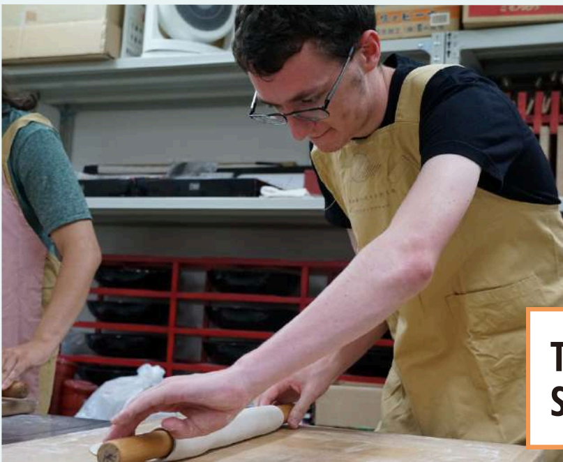
Thursday, Feb 13th Soba Making Experience