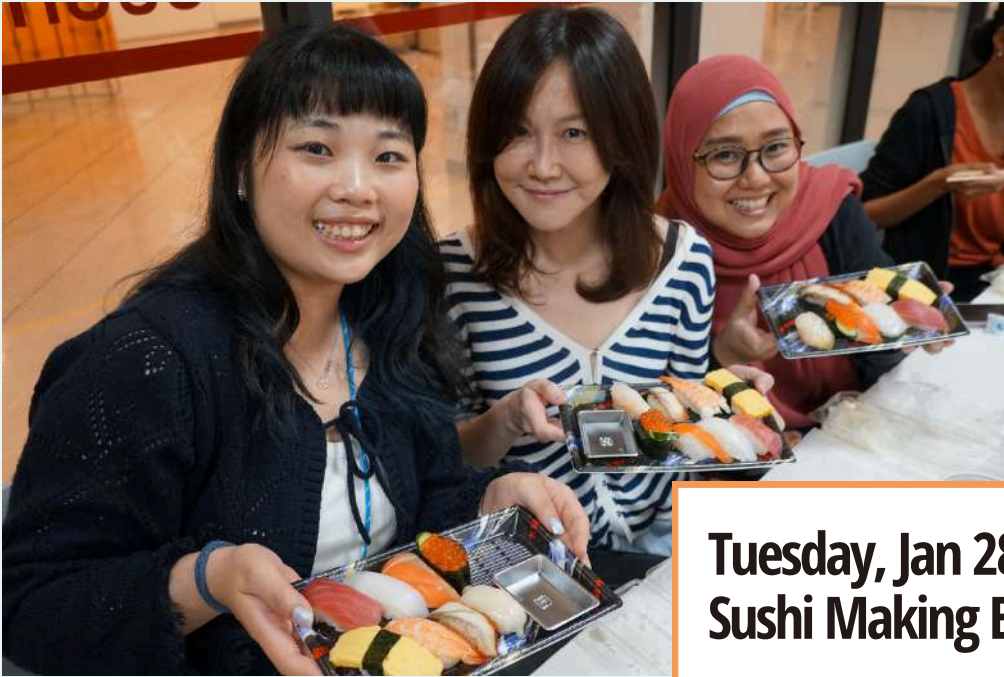
Tuesday, Jan 28th Sushi Making Experience