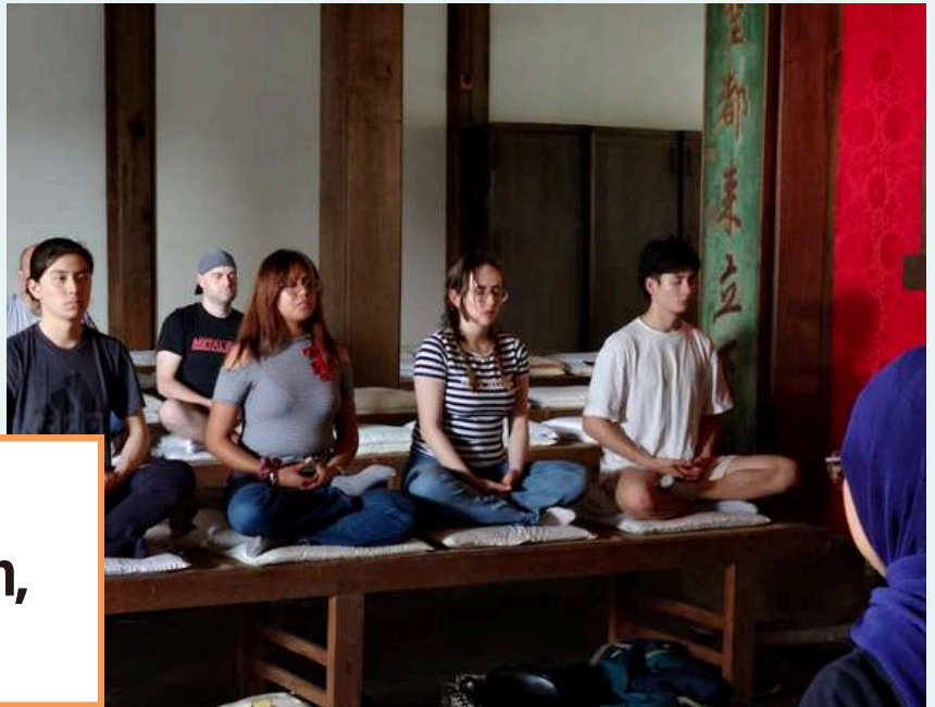
Tuesday, Feb 11th Try the Japanese meditation, Zazen