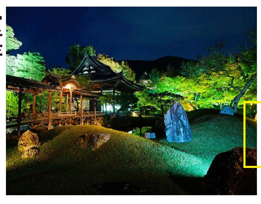
Friday, Aug 9th Let's go to Kodaiji Temple for special evening viewing < 940 JPY >

Saturday, August 10th Ceremony in which paper lantems are floated down a river < 1,560 JPY >