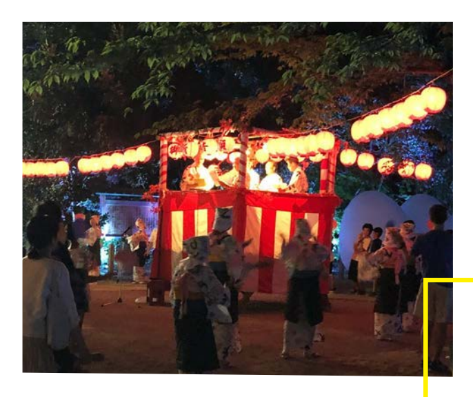
Tuesday, August 13th Bon Dance at Shimogamo Shrine < 520 JPY>