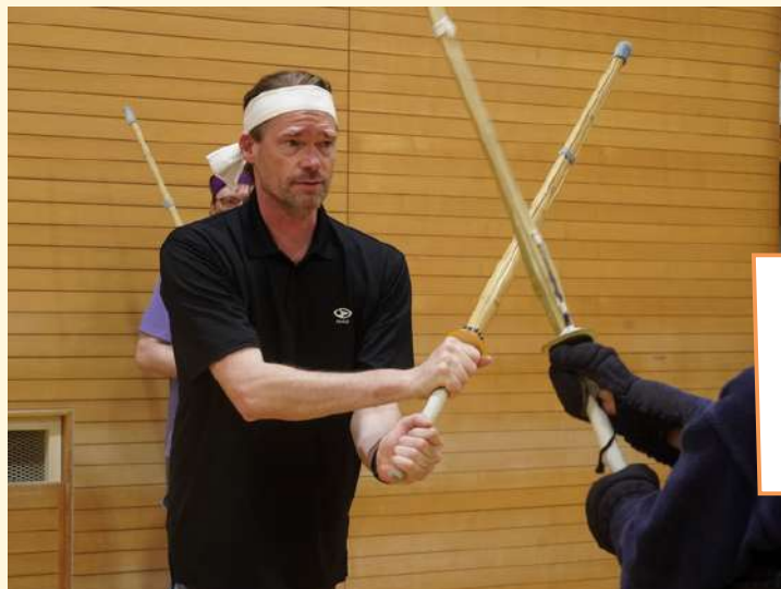
Tuesday, Oct 22nd Kendo Experience