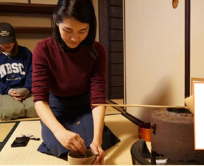
Tuesday, Oct 15th Tea ceremony experience

Thursday, Oct 17th Japanese drumming experience