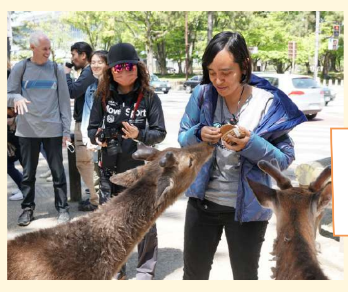
Saturday, Oct 19th Day trip to Nara, Japan's ancient capital<2,360JPY>

Monday, Oct 21st Jidai Matsuri, Festival of Ages Experience <FREE>