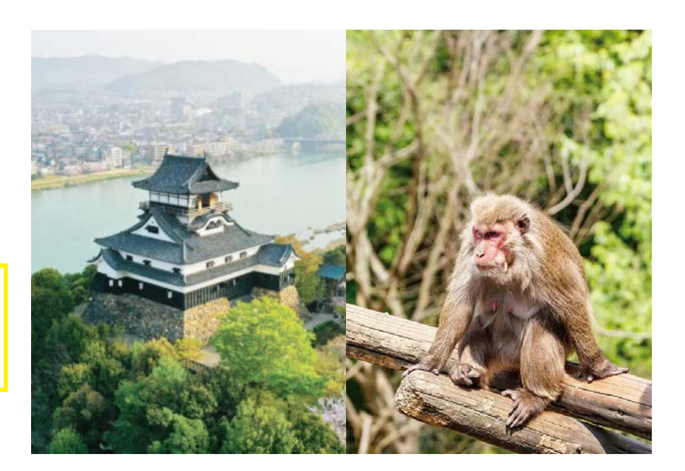
Saturday, August 10th Inuyama castle & Inuyama monkey park <3,260 JPY>

Friday, August 9th International exchange party <2,500 JPY>