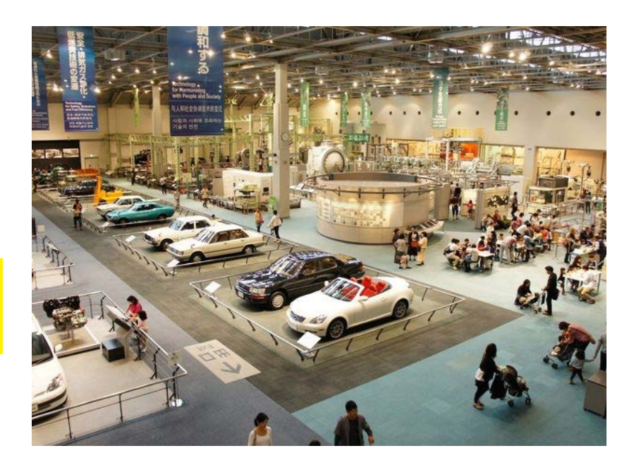
Wednesday, July 31st TOYOTA automobile museum <2,420 JPY>

Tuesday, July 30th Kawaii Nagoya Idol Concert <3,000 JPY>