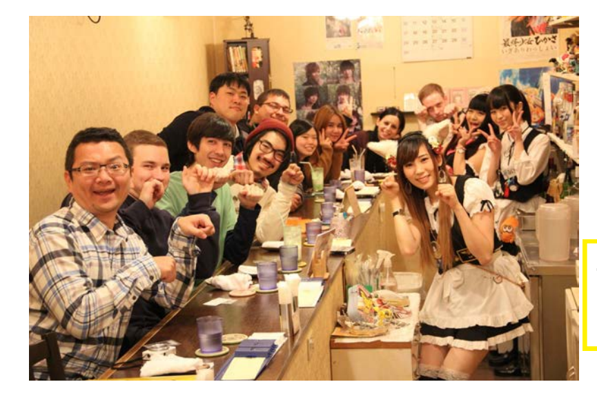
Tuesday, July 16th Maid Cafe Experience & Anime Manga Street <ACTUAL COST>

Monday, July 15th Firework Festival! <¥540 JPY>