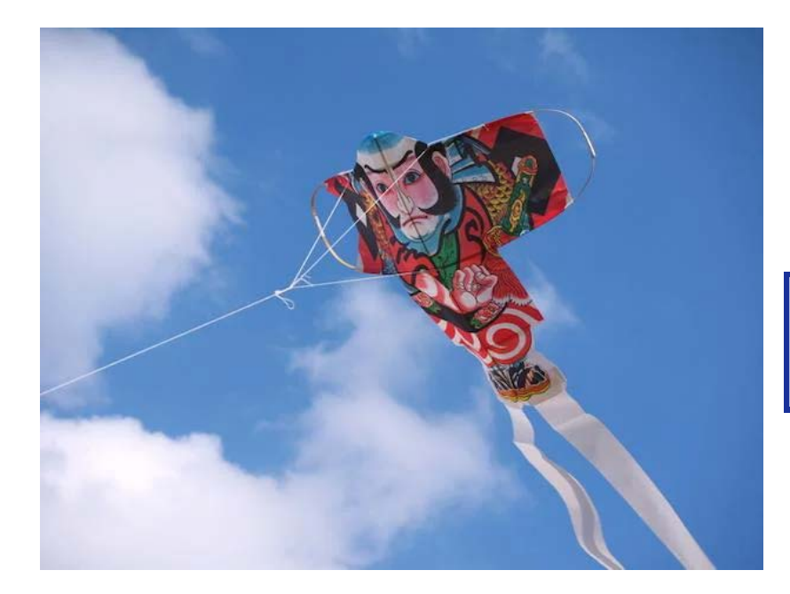
Monday, July 29th Japanese kite makikng experience