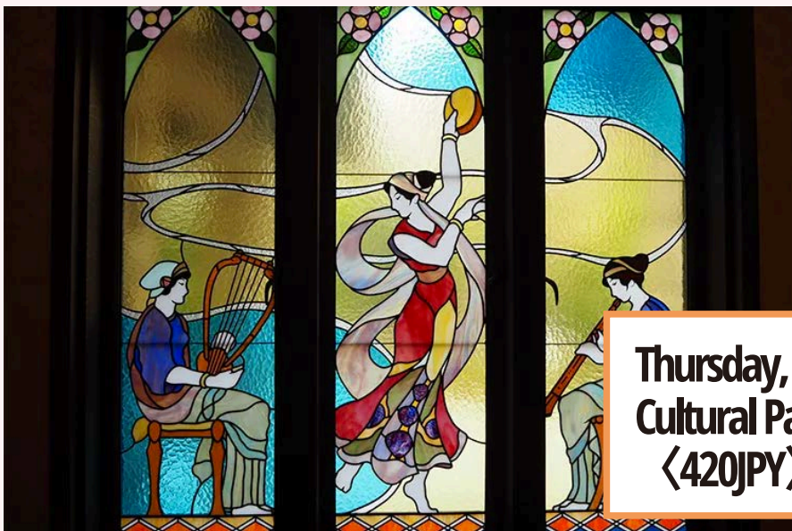
Thursday, May 1st Cultural Path Futaba Museum Tour 〈420JPY〉