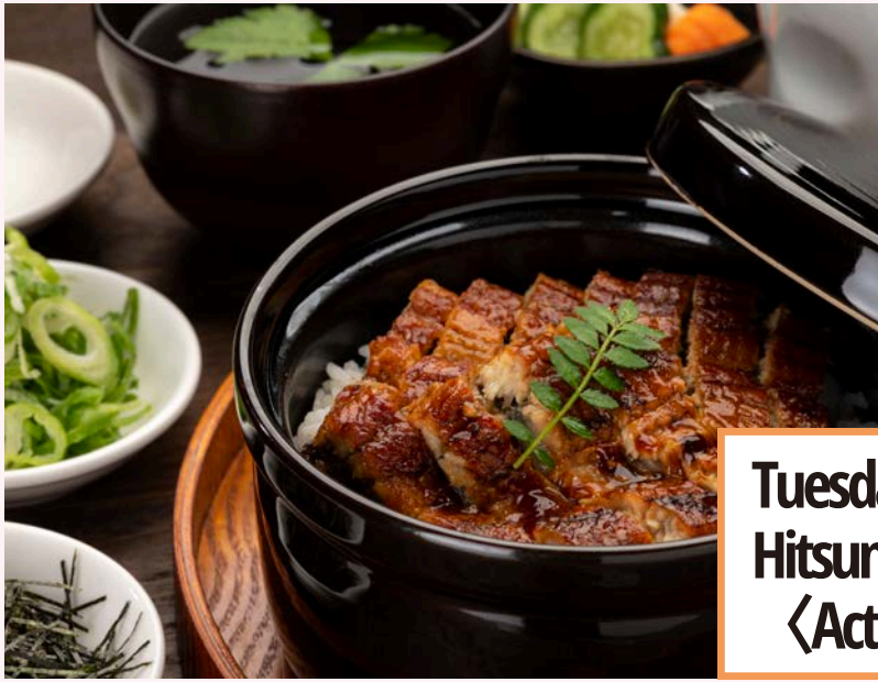
Tuesday, April 22nd Hitsumabushi Lunch 〈Actual Cost〉