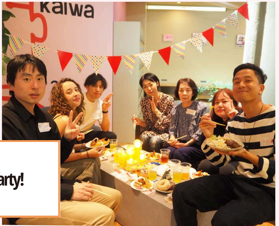
Friday, April 25th International Exchange Party! 〈1,500JPY〉