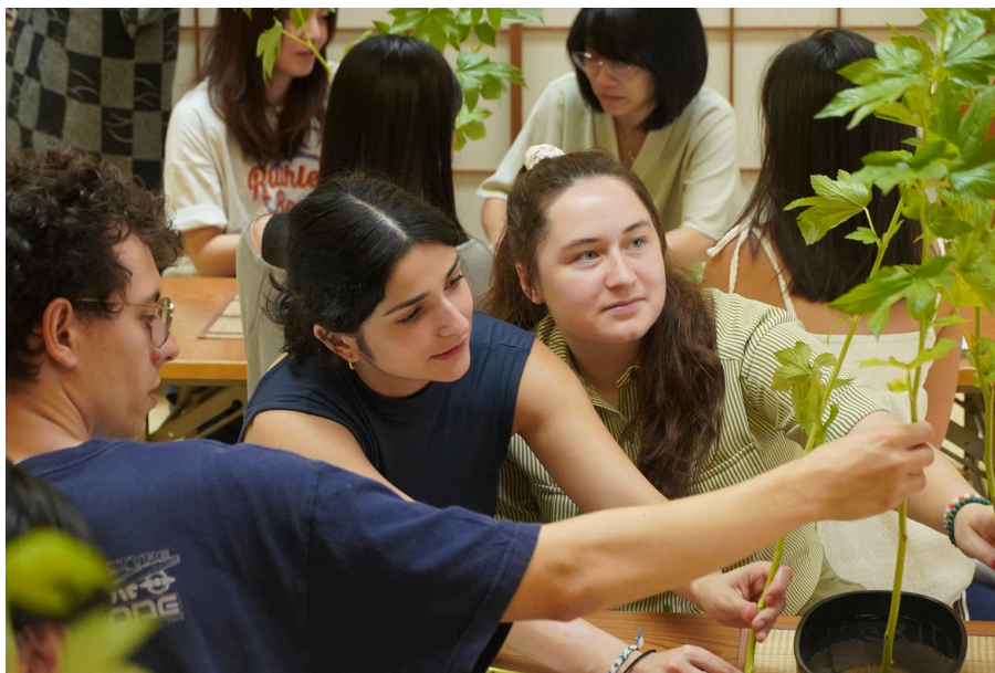
Thursday, July 30th Kado Experience (Japanese Flower Arrangement )