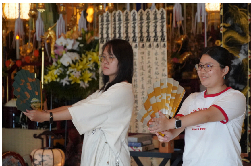
Tuesday, August 4th Noh Theatre Experience