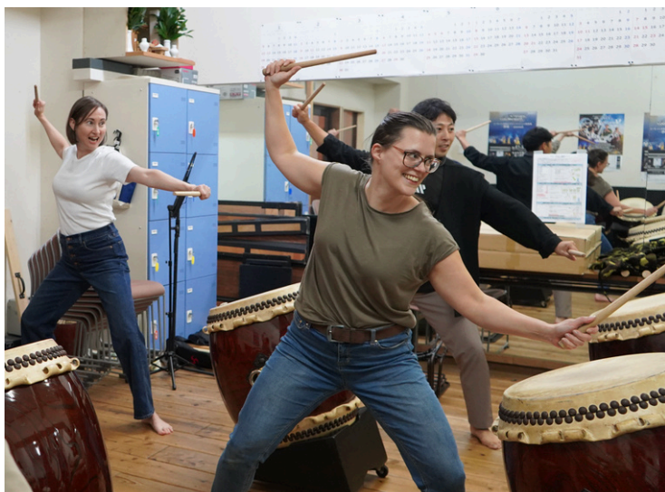
Tuesday, July 28th Wadaiko (Japanese Drum) Experience