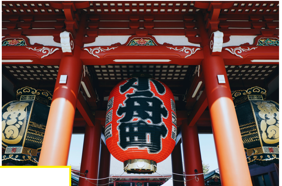
Saturday, February 14th ASAKUSA Tour Experience Japan to the fullest in this Edo Period amusement park!