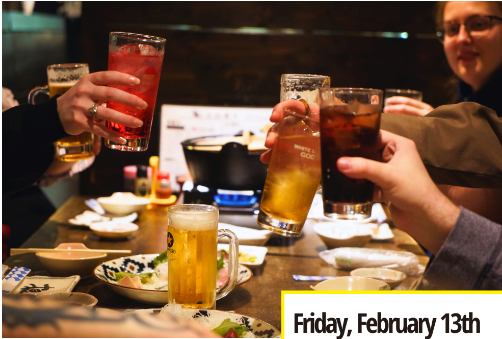
Friday, February 13th Winter Course Graduation Party